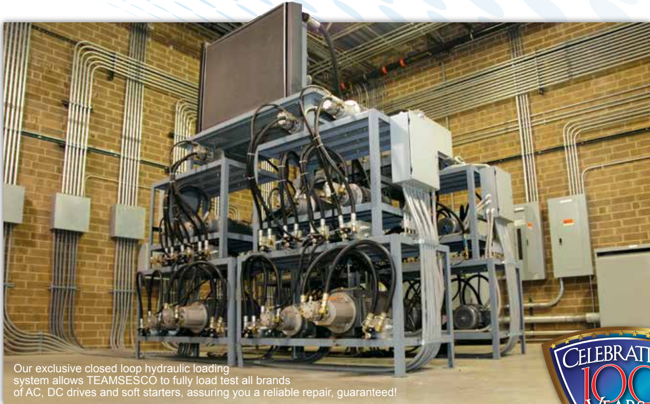
Our exclusive closed loop hydraulic loading system allows TEAMSESCO to fully load test all brands of AC, DC drives and soft starters, assuring you a reliable repair, guaranteed!

THE LEADER IN INDUSTRIAL ELECTRONIC SERVICE